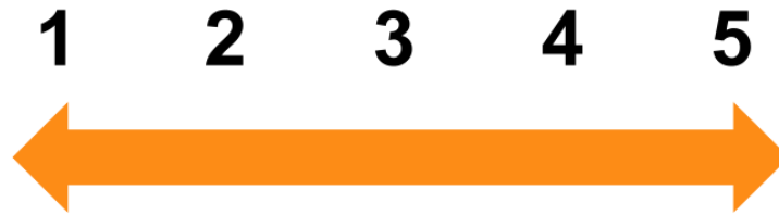
Image: 1 through 5 rating scale along a horizontal orange arrow indicating a spectrum